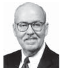
Sen. Cap Dierks