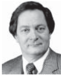
Sen. David Landis

A measure changing the way branch banking is regulated was among the banking and commerce measures considered by lawmakers in 2002.