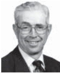
Sen. Carroll Burling

The bill remained on select file before legislators adjourned.