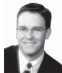
Sen. Philip Erdman