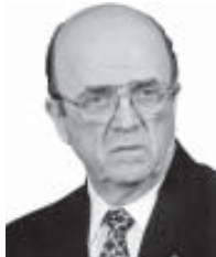
Sen. Gene Tyson

LB 1211 , sponsored by the Transportation and Telecommunications Committee and prioritized by Norfolk Sen. Gene Tyson, permits an interlocal arrangement to facilitate the joint purchase of a statewide public safety radio system. The system will ensure the compatibility of public safety radio systems throughout the state.