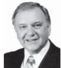
Sen. Curt Bromm

The bill failed to advance from general file by a 21-18 vote.