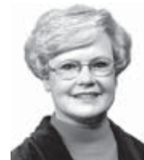
Sen. Deborah Suttle