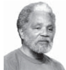
Sen. Ernie Chambers

The measure was given final reading approval by a 44-0 vote.