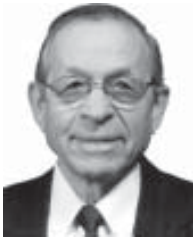
Sen. Bob Kremer

The powers of the Niobrara Council are clarified with regard to rules, internal policies, con-