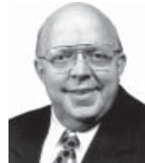
Sen. Dwite Pedersen