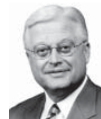
Sen. Kermit Brashear