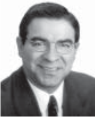
Sen. Ray Aguilar

Under the bill, the Nebraska Supreme Court would have been charged with promulgating rules for administering drug court programs. Interlocal agreements between state and local agencies would have been allowed to implement and manage drug court programs.