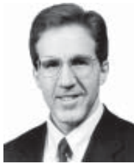
Sen. Chip Maxwell