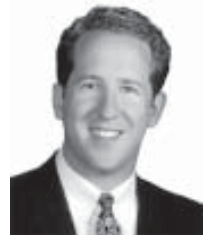
Sen. Adrian Smith