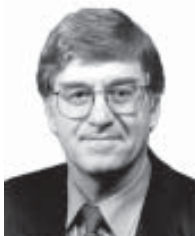
Sen. Ron Raikes

A school district can require students to provide their own musical instruments for optional music courses that are not extracurricular activities if the district provides instruments for low-income students. For music courses extracurricular in nature, a district can require students to furnish instruments, equipment and clothing.