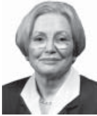
Sen. Jennie Robak

LB 413 remained on select file when the Legislature adjourned.