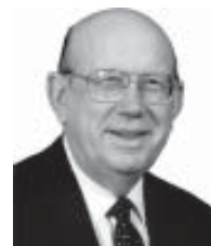
Sen. George Coordsen

Senators voted 30-13 to bracket, or delay further consideration of the bill, until the end of the legislative session. At that time, it was too late for the bill to receive consideration before the Legislature adjourned.