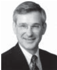
Sen. Bob Wickersham

Senators also voted 33-13 to pass LB 905 , sponsored by Wickersham. LB 905 decouples the state's estate and transfer tax from federal tax code. The bill preserves about $4.4 million of state revenues in FY2003-04.