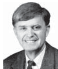
Sen. Chris Beutler

The Education Committee took no action on the bill before the Legislature adjourned.