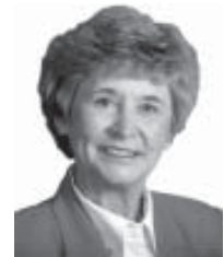
Sen. Elaine Stuhr