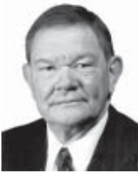
Sen. Ray Janssen

A motion to delay consideration of the bill failed 20-20. Another motion to indefinitely postpone, or kill, the bill failed by a 14-21 vote. No further action was taken on the measure before the Legislature adjourned.