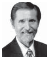
Sen. Don Preister