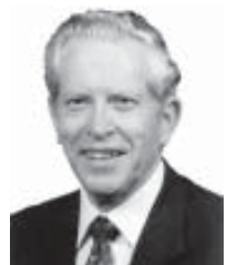
Sen. Lowen Kruse