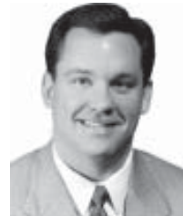
Sen. Jon Bruning