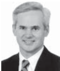
Sen. Mike Foley

The Legislature voted 42-5 to pass the measure.