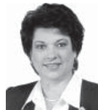
Sen. Vickie McDonald

The Campaign Finance Limitation Act (CFLA), passed in 1992, establishes voluntary spend-