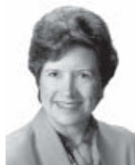
Sen. Pam Redfield