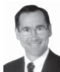
Sen. Mark Quandahl

Under LB 936, cities, counties and natural resources districts could have assessed a fee to