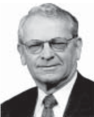
Sen. Floyd Vrtiska

LB 1104 , sponsored by Table Rock Sen. Floyd Vrtiska, would have increased the gallonage tax on beer from 23 cents to 28 cents. The tax is paid by manufacturers and wholesalers of alcohol. The measure would have allocated 5 cents of the proceeds to building renewal projects