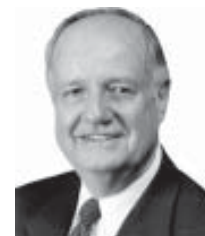
Sen. Don Pederson