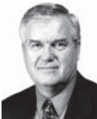
Sen. Ed Schrock