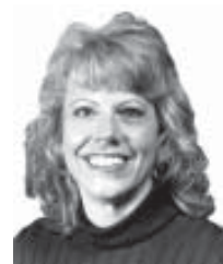
Sen. Pam Brown