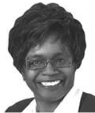
Sen. Brenda Council

LB1036, sponsored by Omaha Sen. Brenda Council, makes existing Nebraska law governing anatomical gifts consistent with federal law and new technologies and practices regarding organ, tissue and eye donation.