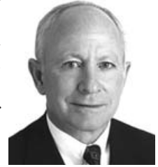
Sen. Greg Adams

the council may levy up to 5 cents for elementary learning center facilities and up to 50 percent of the capital costs for a focus school or program.