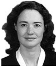
Sen. Abbie Cornett

LB1079, introduced by Bellevue Sen. Abbie Cornett, would authorize single-commissioner hearings for the Tax Equalization and Review Commission (TERC). As amended by a Revenue Committee amendment, the TERC chairperson would be permitted to designate an appeal for a single-commissioner hearing only in the case of protests involving parcels with a taxable value of $1 million or less.