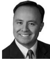
Sen. Tony Fulton

LB801 also would provide protections for Internet users who may unknowingly cause their personal files to be made public. The bill prohibits the distribution of peer-to-peer file-sharing programs that do not provide clear notice to users that files on their computer will be made available to the public and do not require intentional action from the user to activate the file sharing function. The bill also