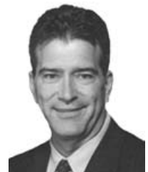
Sen. Tom White

LB952, introduced by Omaha Sen. Tom White, would exempt from sales tax gross income received by a public sewer utility in order to address combined sewer overflow. The Environmental Protection Agency describes this as discharge of untreated wastewater from a combined sewer system at a point prior to the headworks of a publicly owned treatment works.