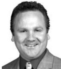
Sen. Colby Coash

Senators approved the bill on a 49-0 vote.