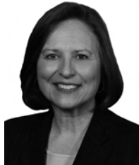
Sen. Deb Fischer