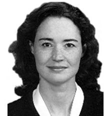
Sen. Abbie Cornett

Meets: Wednesdays, Thursdays and Fridays — Room 1524