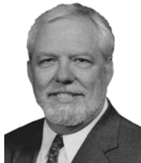
Sen. Rich Pahls