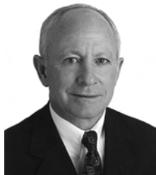
Sen. Greg Adams