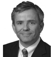
Sen. Steve Lathrop